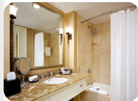
Standard Room Bath