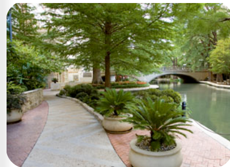
Hotel River Walk Area